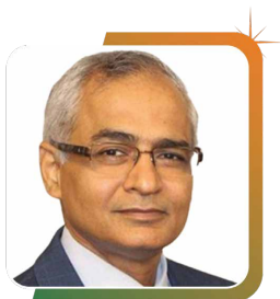
Dr. Neeraj Mittal

Minister of State for Communications, Department of Telecommunications Government of India