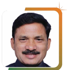
Shri Devusinh Chauhan

Minister of State for Communications, Department of Telecommunications Government of India